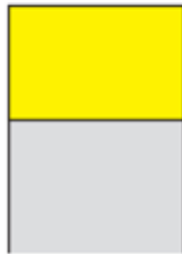
Seal Profile: DST108

Submit completed form by email to info@nuraseal.com or by fax to 905.795-8381