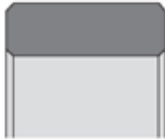
Seal Profile: DF101

Submit completed form by email to info@nuraseal.com or by fax to 905.795-8381