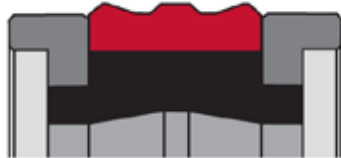
Seal Profile: DK109D

Submit completed form by email to info@nuraseal.com or by fax to 905.795-8381