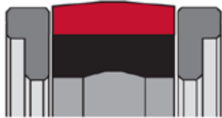
Seal Profile: DK109

Submit completed form by email to info@nuraseal.com or by fax to 905.795-8381