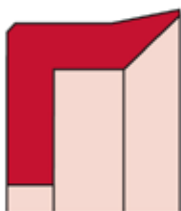
Seal Profile: DK116

Submit completed form by email to info@nuraseal.com or by fax to 905.795-8381