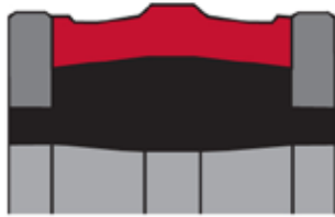
Seal Profile: DK222A

Submit completed form by email to info@nuraseal.com or by fax to 905.795-8381