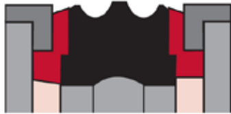
Seal Profile: DK223AW

Submit completed form by email to info@nuraseal.com or by fax to 905.795-8381