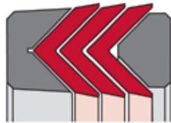
Seal Profile: DS110-112

Submit completed form by email to info@nuraseal.com or by fax to 905.795-8381