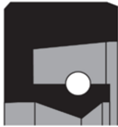
Seal Profile: DR204

Submit completed form by email to info@nuraseal.com or by fax to 905.795-8381