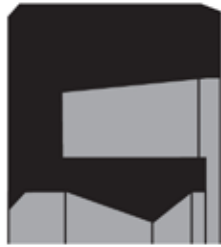
Seal Profile: DR207

Submit completed form by email to info@nuraseal.com or by fax to 905.795-8381