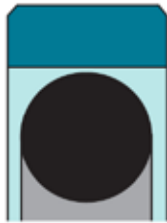
Seal Profile: DK108

Submit completed form by email to info@nuraseal.com or by fax to 905.795-8381