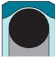
Seal Profile: DK142

Submit completed form by email to info@nuraseal.com or by fax to 905.795-8381