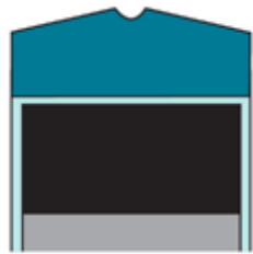
Seal Profile: DK143

Submit completed form by email to info@nuraseal.com or by fax to 905.795-8381