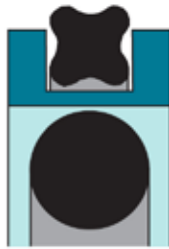
Seal Profile: DK145

Submit completed form by email to info@nuraseal.com or by fax to 905.795-8381