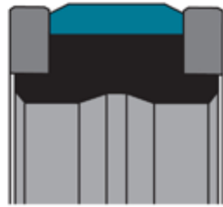
Seal Profile: DK222

Submit completed form by email to info@nuraseal.com or by fax to 905.795-8381