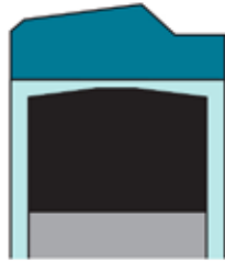
Seal Profile: DK238

Submit completed form by email to info@nuraseal.com or by fax to 905.795-8381