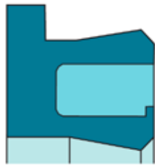
Seal Profile: DR117

Submit completed form by email to info@nuraseal.com or by fax to 905.795-8381