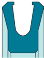
Seal Profile: DR119

Submit completed form by email to info@nuraseal.com or by fax to 905.795-8381