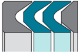
Seal Profile: DS127

Submit completed form by email to info@nuraseal.com or by fax to 905.795-8381