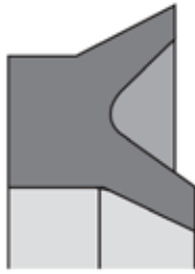
Seal Profile: DA114

Submit completed form by email to info@nuraseal.com or by fax to 905.795-8381